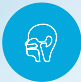
Ear, Nose & Throat (ENT)