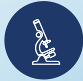
Integrated Lab Services