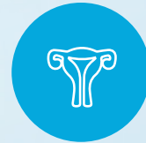
Obstetrics & Gynecology