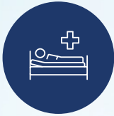
Wound care & Bed- sores